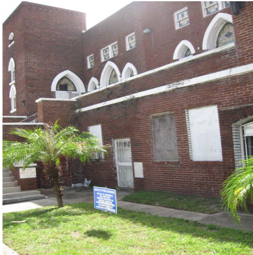
Historic Second Missionary Baptist Church, 954 Kings Road, October 2014

The design of the Second Missionary Baptist Church represents a fine example of a vernacular or folk adaptation of the Late Gothic Revival Style, usually associated with the high style design of major religious or educational institutions. In its high form, the Late Gothic Revival Style is evident by steeply pitched gable roofs usually with intersecting cross-gables, varied window treatment including lancet, cantilevered oriels with abundant art glass, ornate window tracery, battlements and towers. Many times the exterior of Gothic Revival buildings are richly detailed with stone or cast stone trim and clay tile roof. The general effect of the Late Gothic Revival Design as displayed in both high and vernacular adaptations is to achieve a strong presence, to create a sense of permanency, power, and importance all attributes fitting to religious and educational institutions. Elements of the Late Gothic Revival Style reflected in the design of Second Missionary Baptist Church include the massive towers that frame the entryway, the use of arched windows with hoodmolds, entryway framed with cast stone, as well as the facades divided vertically by buttresses.